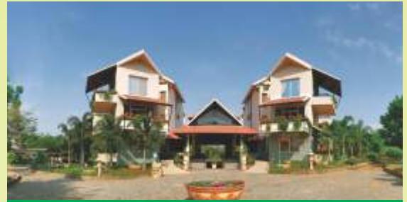
The nature's paradise

Pragati Group specialises in bringing you smart garden colonies to give relief from the ever growing urban adulterated and polluted living to provide a bio-diverse, pure living environment. Pragati has been recognised by United Nations and the global community for successfully maintaining the balance of nature to sustain the ecology at its Pragati Bio diversity Knowledge Park in Hyderabad. The park spread over 2500 acres has been transformed into a lush green, bio-diverse, self sustainable living space with 33 lac herbal, fruit and wood bearing trees based on the practices of Indian scientific traditions and sacred methodologies. The arrangement of 800 varieties of sacred herbal and heritage medicinal plantations at various pockets here called Aushadhies are Pranapradatas and Arogyapradatas. They remove toxins from the body, refresh an individual through aroma therapy and have made the area completely free from mosquitoes, bad bacteria and viruses. The flora support system has been augmented with water bodies and an innovative water supply system to reduce the temperature here 6-7 C° lesser than city levels. The zero pollution, carbon free environment here can further be substantiated by the prevailing ambient air quality standard of only 1.4 in Pragati as against the permissible limit of 100.